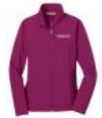
Port Authority Ladies Core Soft Shell Jacket Port Authority $35.00