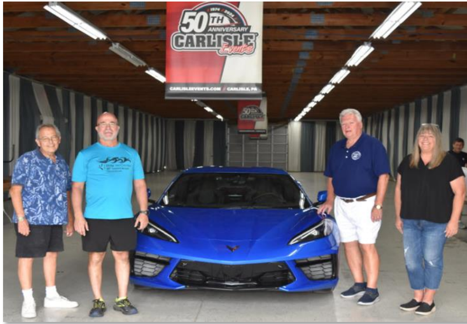
Picture of Winner from President's Message