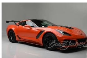
1053.1 - Contingency Car