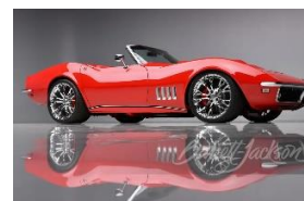
1338.1 - Contingency Car