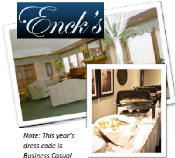
Note: This year's dress code is Business Casual