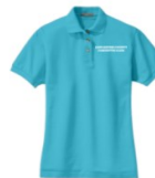
Ladies Pique Knit Polo Port Authority $19.00