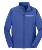
Core Soft Shell Jacket Port Authority $35.00