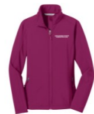
Port Authority Ladies Core Soft Shell Jacket Port Authority $35.00